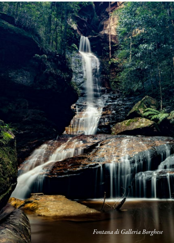
Fontana di Galleria Borghese

of Australian, European, and Asian art. In addition to its permanent exhibits, the gallery frequently hosts special exhibitions, workshops, and events. The serene setting and the café with its panoramic views of Sydney Harbour make it a perfect spot to spend a reflective afternoon.