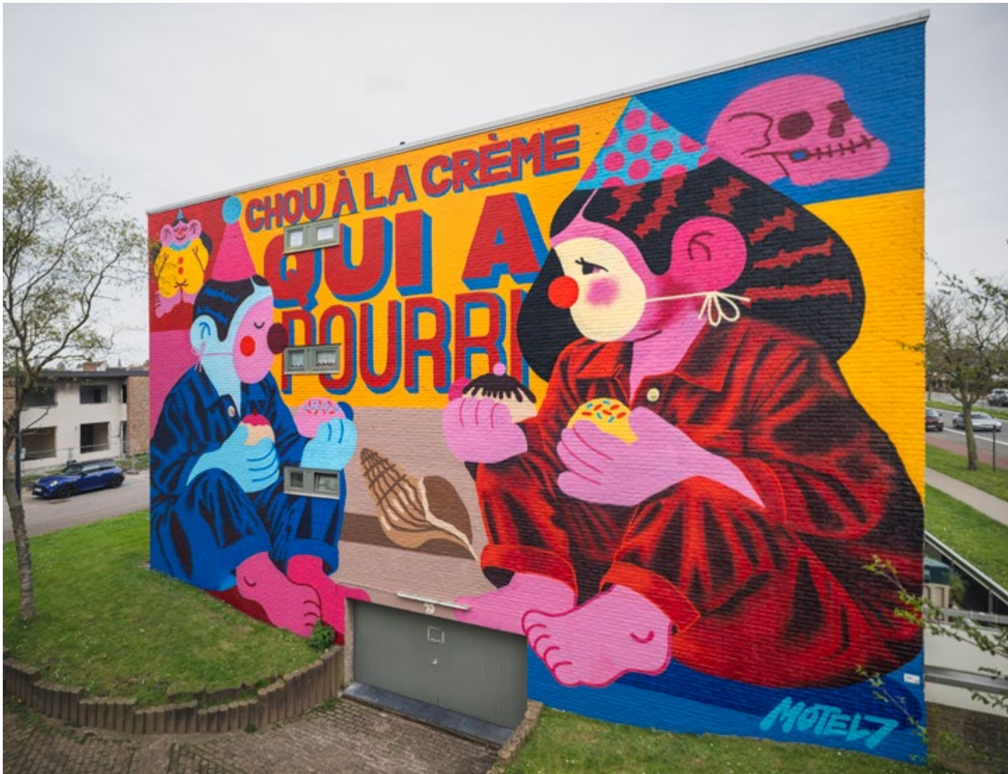
Motelseven: "A Cream Puff Gone Rotten"

the playful, dark, and tongue-in-cheek nature of Ensor's work while incorporating Motelseven's passion for pastry.