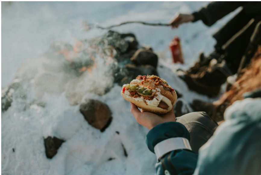
Reindeer Sausage, a Traditional Delicacy (by Roxana Zerni)