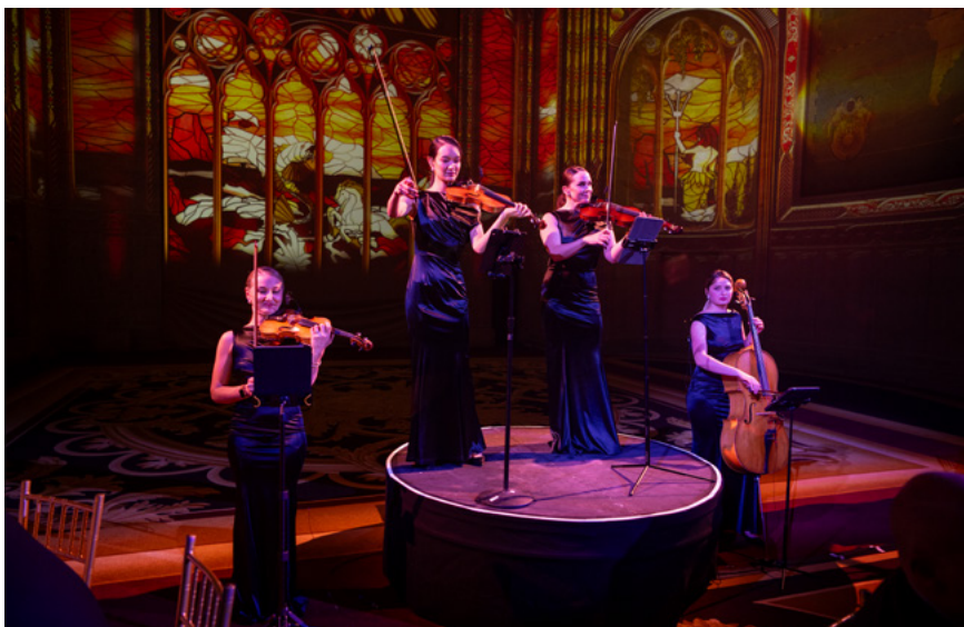
75 th Anniversary Gala Dinner in New York