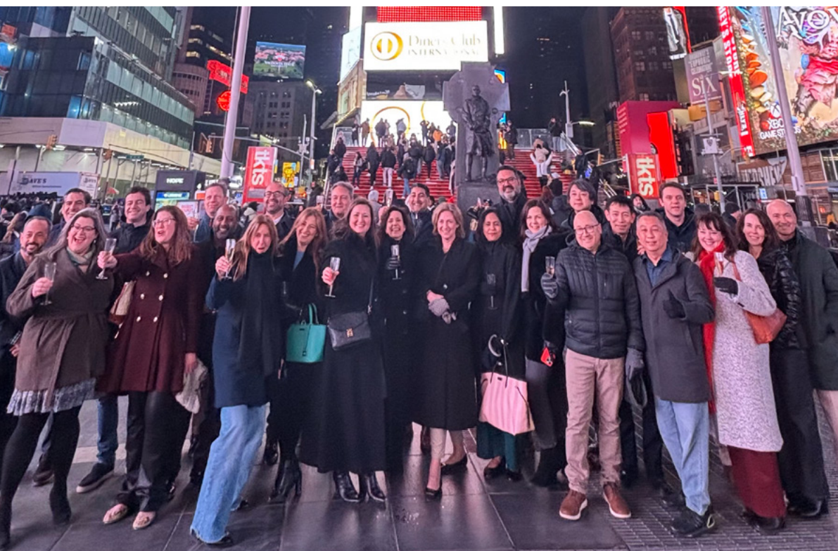
Diners Club Representatives from Across the Globe in Times Square