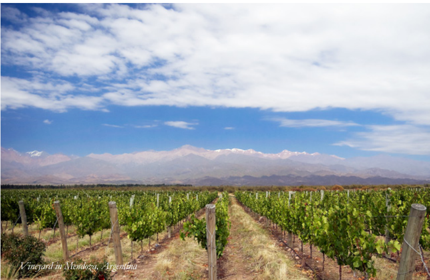
Vineyard in Mendoza, Argentina

about local Indigenous food and culture with Noongar Elder, Dale Tilbrook. It's wine paired with storytelling, paired with local ingredients foraged on Noongar land.