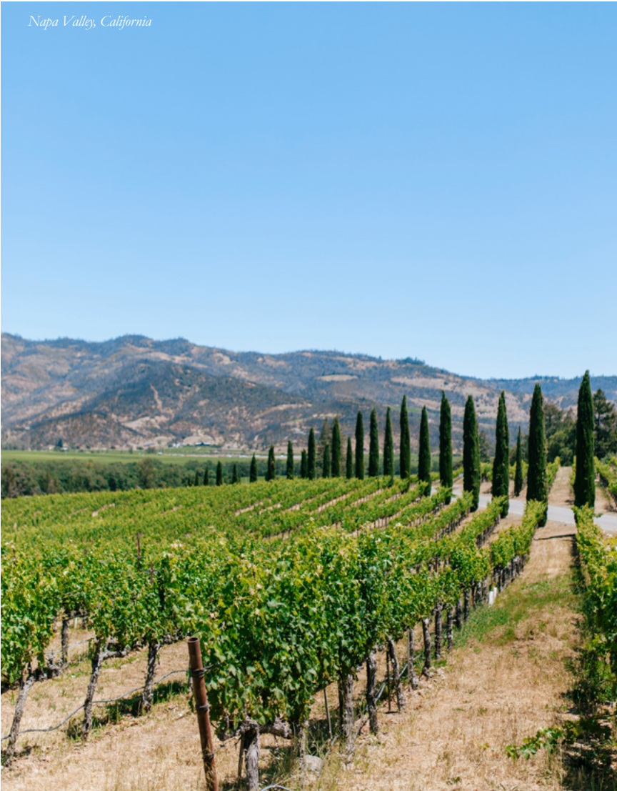
Napa Valley, California