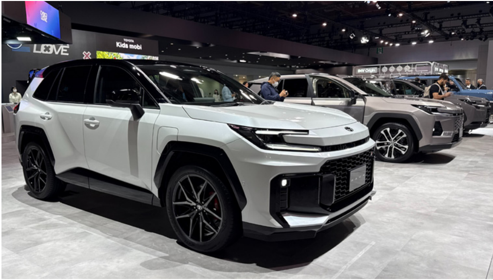
LS (Lexus Space) Concept